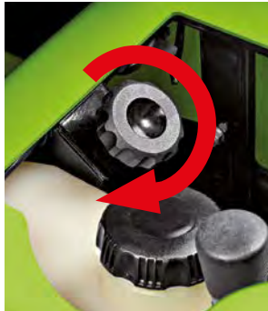
Details of the adjustment

The blades automatically disengage when the grass catcher is full. There is also the possibility to choose the “buzzer” option to signals that the catcher is full, without stopping the blades.