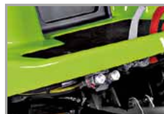
Standard auxiliary hydraulic ports.