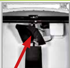
Mobile grass distributor