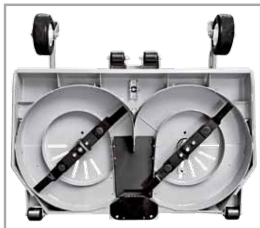
Mulching kit as a standard feature on cutting decks with collection