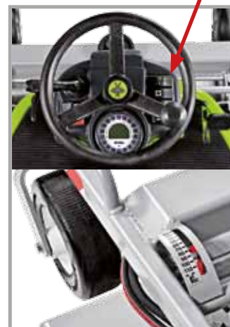
Hydraulic and continuous cutting height adjustment

The FD 13.09 can be equipped with two kinds of mower deck, 132 cm or 155 cm with collection and mulching kit . Both cutter decks are centre-positioned, extremely robust and the transmission is via cardan joint with oil-bath angle gearboxes.